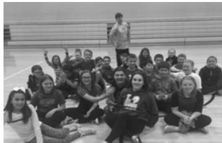
Our 5th and 6th grade Youth Group having fun in the Angelus Center.

Being silly at the Kids Night Out fundraiser. The Youth Group has been raising money for their trip to Camp Zion!